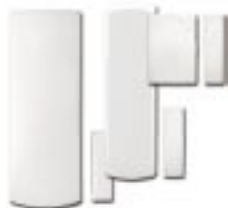
Long-Range Door Contact MG-DCT1