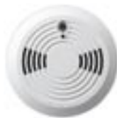
Smoke Detector SD738 Made by EVERday (Taiwan) †