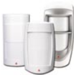
Analog Single-Optic PIR (18kg/40lb Pet Immunity) MG-PMD1P

Choose from wireless motion detectors that are immune to pets, door contacts, and remote controls that automate your most frequently used security functions. Magellan is perfect for securing your home and small business.